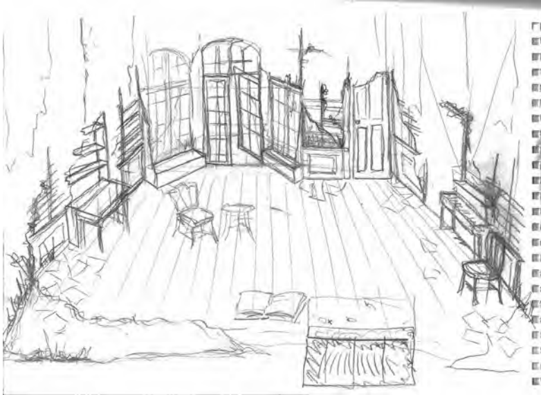
The original set design sketch for Jane Eyre

When the director and I first talked about the design for the production, one of the themes we wanted to focus on was the burnt out remains of Thornfield Hall.